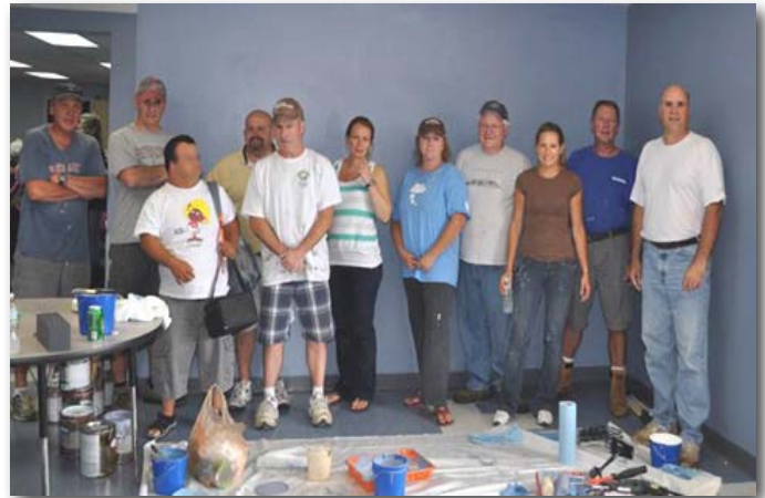
On a hot summer day in August, 10 employees from EMC in Franklin generously donated a whole day’s work to give our Bellingham Day Hab a fresh coat of paint. The team was happy to lend a hand and to have the opportunity to see our mission in action.