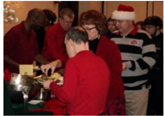
Guests enjoying a delicious Holiday Buffet at HMEA's 2016 Annual Shared Living Holiday Party

A very special thank you to the LaSalette Shrine for its generous donation which helped to make this holiday party another success. And, we would also like to mention how much we appreciate the staff and crew of Lake Pearl Wrentham for always making this event so very special for everyone at HMEA.