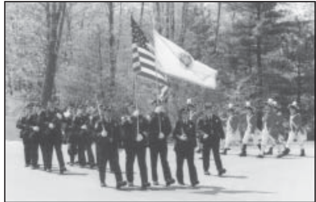
The award-winning Franklin Police Color Guard lead the Pawtuxet Rangers into the park to open the 2nd Annual Independence 5K ceremonies