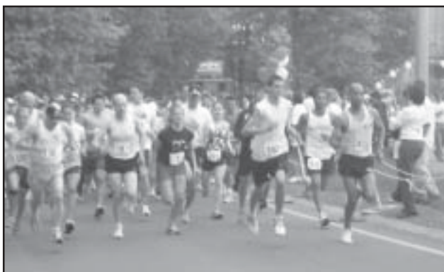
AND "They're Off..."