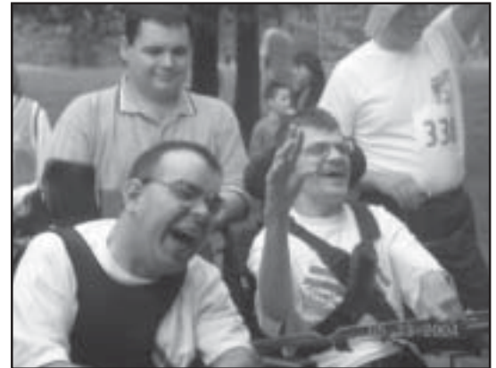
Family & Friends cheer on the runners and walkers at the finish line