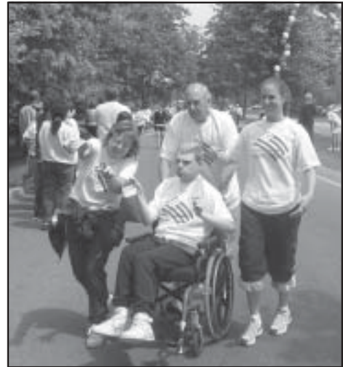
Some 'happy' walkers as they approach the home stretch!

Bella Gentes' Bose® Corporation Boston Celtics Boston Harbor Hotel Boston Sports Club Brad's Gourmet Deli Grafton Greenhouses & Flower Shop Harvest Café, Hudson Marriott Hotel (Newport RI) New England Runner Newport Bay Club Party Lite Pizza Hut Riverview Furniture The Body Shop The Florentina Restaurant The Great Canadian Canoe Company The Pet Barber Valley Custom Furniture Village Photo Shop Wachusett Mountain