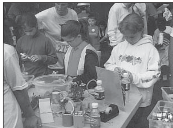
Kids enjoying the "Kids Corner" organized and run by HMEA's Children's Services division