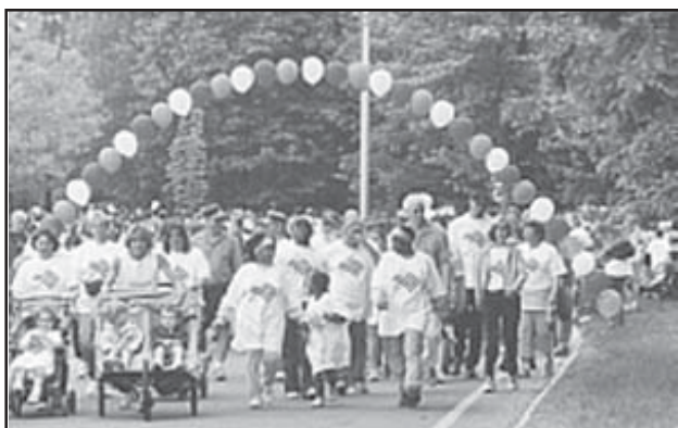
Hundreds of walkers passed through the "Archway of Balloons" at the start of the 5K Walk